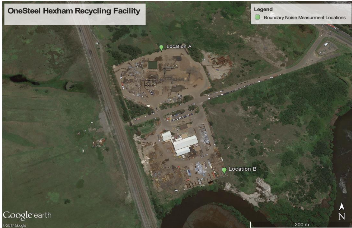
Figure 2 Site Boundary Measurement Locations