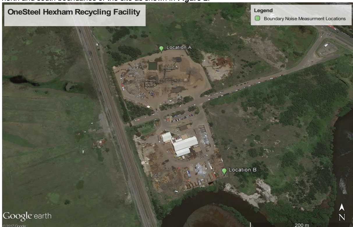
Figure 2 Site Boundary Measurement Locations

Due to external noise sources dominating at the EPL monitoring locations, attended noise measurements were also conducted on the north and south boundaries of the site during day, evening and night periods in order to quantify site noise emissions for the prediction of noise levels at each receiver location in the absence of extraneous noise. Attended noise monitoring was conducted at the north and south boundaries of the site as shown in Figure 2 .