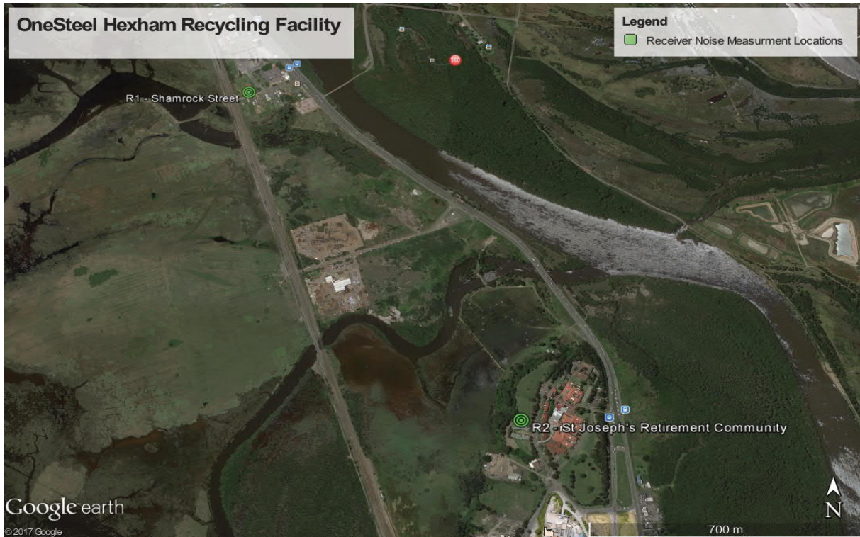
Figure 1 OneSteel Site and Receiver Locations

Due to external noise sources dominating at the EPL monitoring locations, attended noise measurements were also conducted on the north and south boundaries of the site during day, evening and night periods in order to quantify site noise emissions for the prediction of noise levels at each receiver location in the absence of extraneous noise. Attended noise monitoring was conducted at the north and south boundaries of the site as shown in Figure 2 .