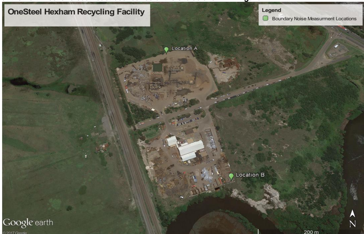
Figure 2 Site Boundary Measurement Locations

Due to external noise sources dominating at the EPL monitoring locations, attended noise measurements were also conducted on the northwest and southeast boundaries of the site during day, evening and night periods in order to quantify site noise emissions for the prediction of noise levels at each receiver location in the absence of extraneous noise. Attended noise monitoring was conducted at the northwest and southeast boundaries of the site as shown in Figure 2 .