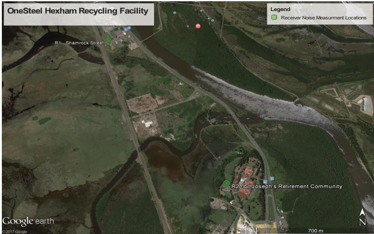
Figure 1 OneSteel Site and Receiver Locations

Due to external noise sources dominating at the EPL monitoring locations, attended noise measurements were also conducted on the northwest and southeast boundaries of the site during day, evening and night periods in order to quantify site noise emissions for the prediction of noise levels at each receiver location in the absence of extraneous noise. Attended noise monitoring was conducted at the northwest and southeast boundaries of the site as shown in Figure 2 .