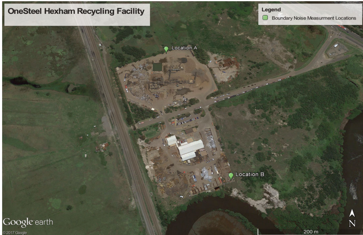
Figure 2 Site Boundary Measurement Locations

Attended noise monitoring was conducted at the north and south boundaries of the site as shown in Figure 2 .