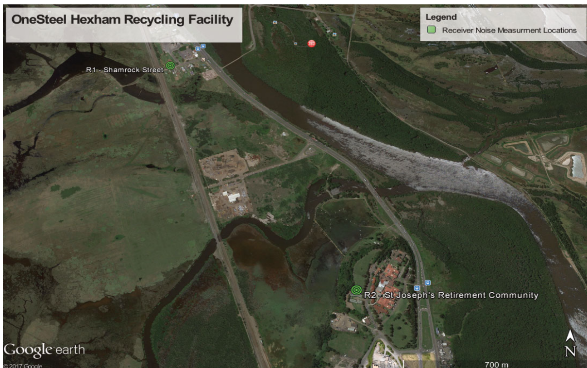
Figure 1 Liberty Site and Receiver Locations

These EPL locations were selected as the nearest residential receiver locations to the north and south of the site. The monitoring locations are shown in Figure 1 .