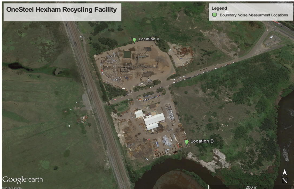
Figure 2 Site Boundary Measurement Locations

Due to external noise sources dominating at the EPL monitoring locations, attended noise measurements were also conducted on the north and south boundaries of the site during day, evening and night periods in order to quantify site noise emissions for the prediction of noise levels at each receiver location in the absence of extraneous noise. Attended noise monitoring was conducted at the north and south boundaries of the site as shown in Figure 2 .