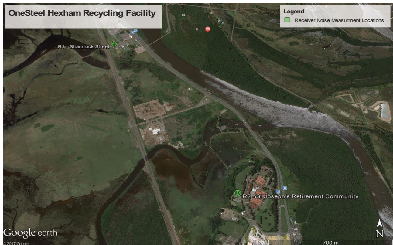
Figure 1 InfraBuild Site and Receiver Locations

These EPL locations were selected as the nearest residential receiver locations to the north and south of the site. The monitoring locations are shown in Figure 1 .