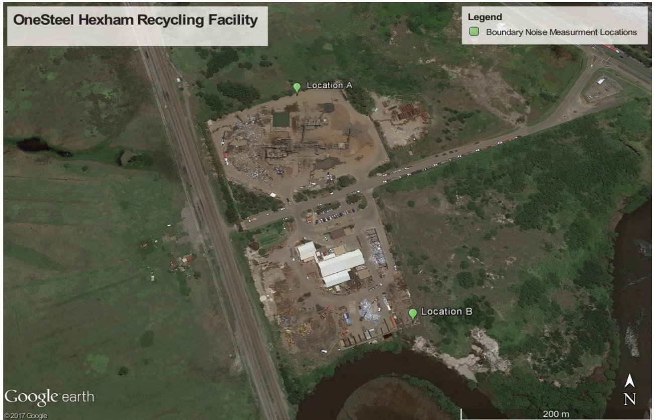
Figure 2 Site Boundary Measurement Locations

Due to external noise sources dominating at the EPL monitoring locations, attended noise measurements were also conducted on the north and south boundaries of the site during day, evening and night periods in order to quantify site noise emissions for the prediction of noise levels at each receiver location in the absence of extraneous noise. Attended noise monitoring was conducted at the north and south boundaries of the site as shown in Figure 2 .