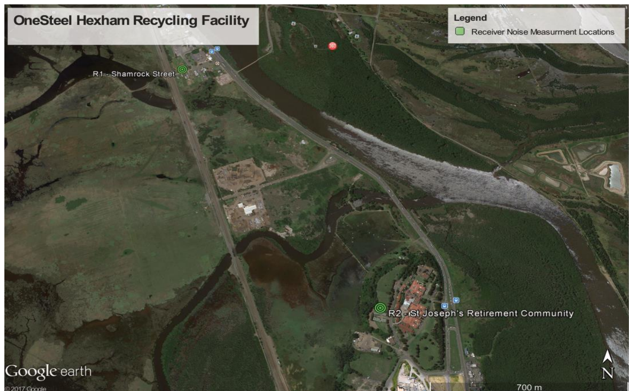
Figure 1 InfraBuild Site and Receiver Locations

These EPL locations were selected as the nearest residential receiver locations to the north and south of the site. The monitoring locations are shown in Figure 1 .