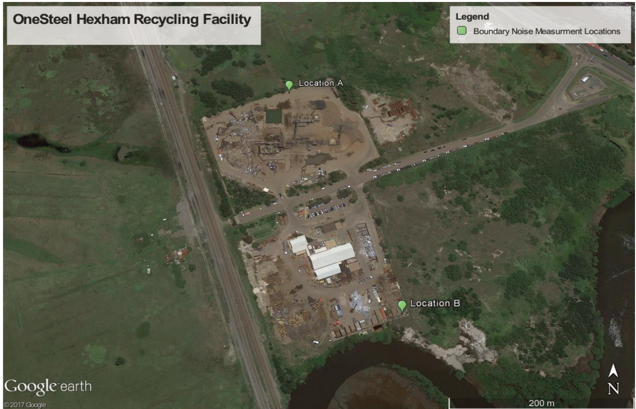
Figure 2 Site Boundary Measurement Locations

Due to external noise sources dominating at the EPL monitoring locations, attended noise measurements were also conducted on the north and south boundaries of the site during day, evening and night periods in order to quantify site noise emissions for the prediction of noise levels at each receiver location in the absence of extraneous noise. Attended noise monitoring was conducted at the north and south boundaries of the site as shown in Figure 2 .