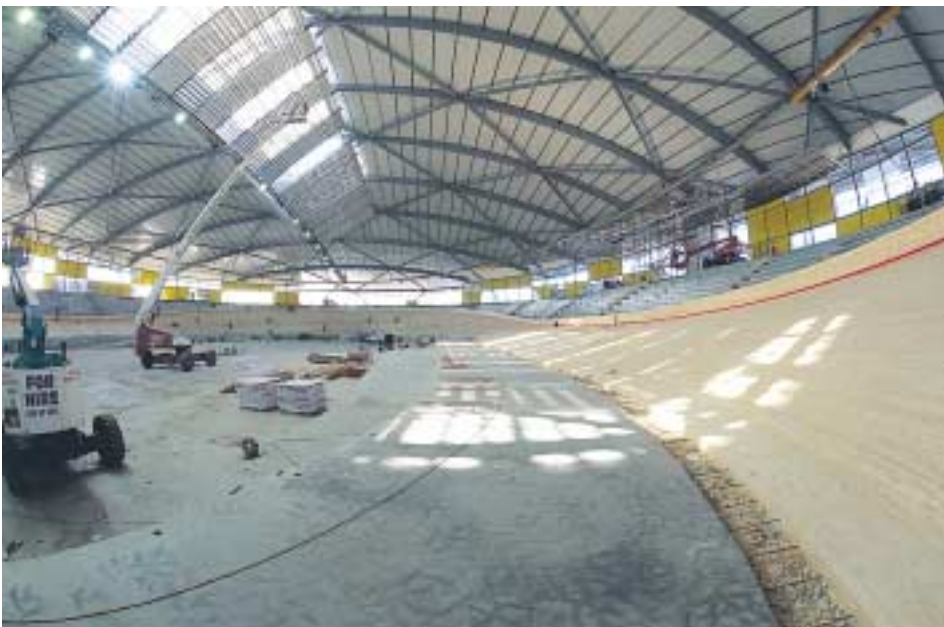
Internal view at track level, during construction.

In addition, sun shades external to the western side of the building shield the velodrome from the hot afternoon sun.