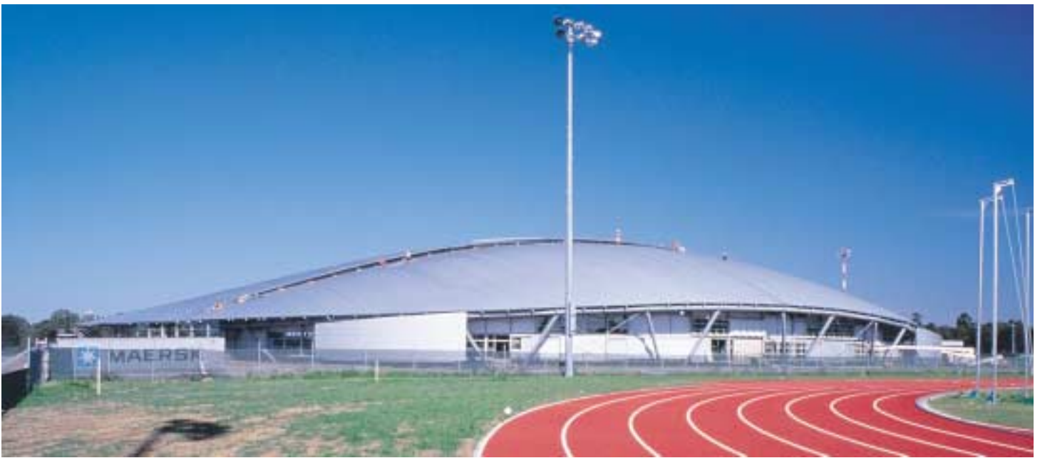
Olympic Velodrome showcases steel, continued

environmental strategy that maximises the use of natural light and ventilation.