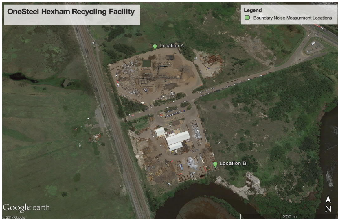
Figure 2 Site Boundary Measurement Locations

Due to external noise sources dominating at the EPL monitoring locations, attended noise measurements were also conducted on the north and south boundaries of the site during day, evening and night periods in order to quantify site noise emissions for the prediction of noise levels at each receiver location in the absence of extraneous noise. Attended noise monitoring was conducted at the north and south boundaries of the site as shown in Figure 2 .