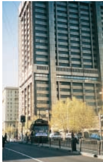
Melbourne landmarks benefit from BHP fire research – 140 William Street, 1 William Street, 120 Spencer Street and 360 Collins Street.