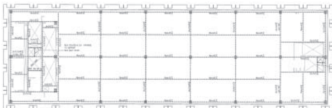
Top: Council House, Perth.