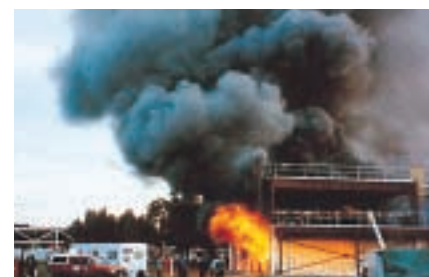
Fire test at BHP Research, Melbourne Laboratories.

It was found that provided the refurbished building incorporated a sprinkler system with an improved level of reliability, the building with unprotected steel beams, would offer a higher level of life safety than that associated with a building which satisfied the minimum