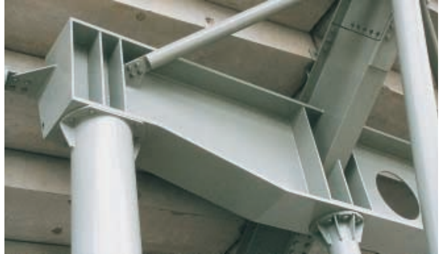
Above: Eastern Stand, L4 transfer beams. Below: Eastern Stand section, Bay 26.