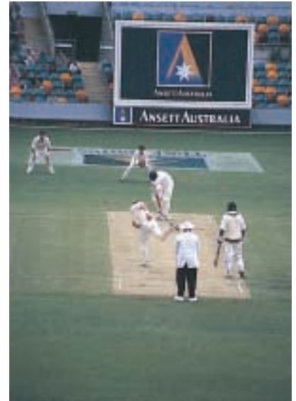
The 'Gabba' played host to the recent Australia v Pakistan one-day match.

additional tier to the Western and Southern Stands and part of the Eastern Stand, and the relocation of the Hill Scoreboard to the Western Stand, and the dramatic cantilevering of the Southern Stand over Stanley Street. A particular challenge was the dramatic 13m cantilever over the four-lane Stanley Street.