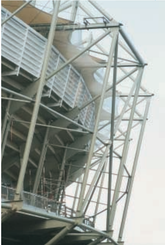
The distinctive steel signature of the Southern Stand.

An application was successfully made to the Queensland Building Tribunal (based on a BHP Research report) to vary the building regulations to permit the use of fire engineering analysis and unprotected steel framing. The analysis considered the effect of a non-sprinklered “flashover” fire in various parts of the building and showed that unprotected steelwork would perform adequately in fire and could be used in most locations within the structure. The application was approved, enabling savings of approximately $0.5M in the cost of passive fire protection to steelwork.