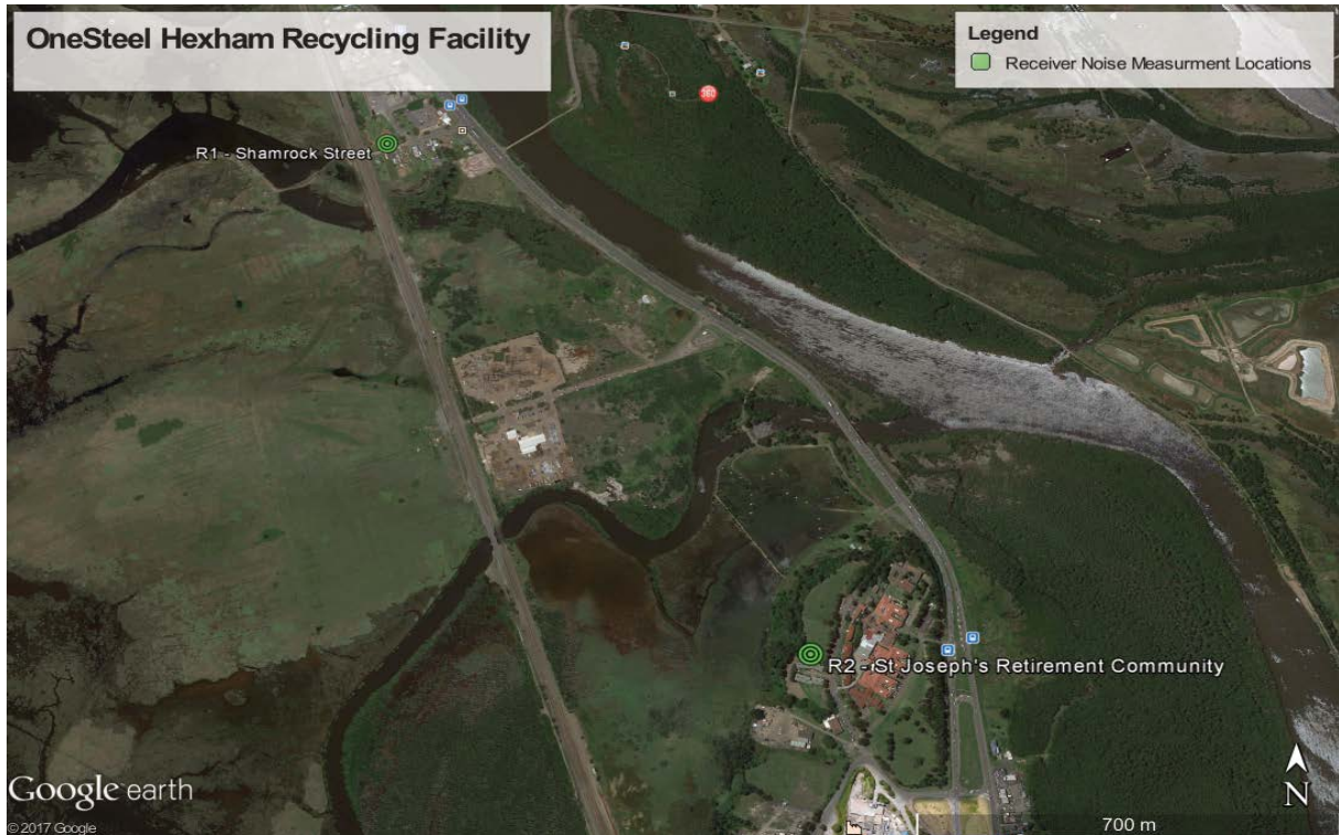
Figure 1 OneSteel Site and Receiver Locations

Due to external noise sources dominating at the EPL monitoring locations, attended noise measurements were also conducted on the north and south boundaries of the site during day, evening and night periods in order to quantify site noise emissions for the prediction of noise levels at each receiver location in the absence of extraneous noise. Attended noise monitoring was conducted at the north and south boundaries of the site as shown in Figure 2 .