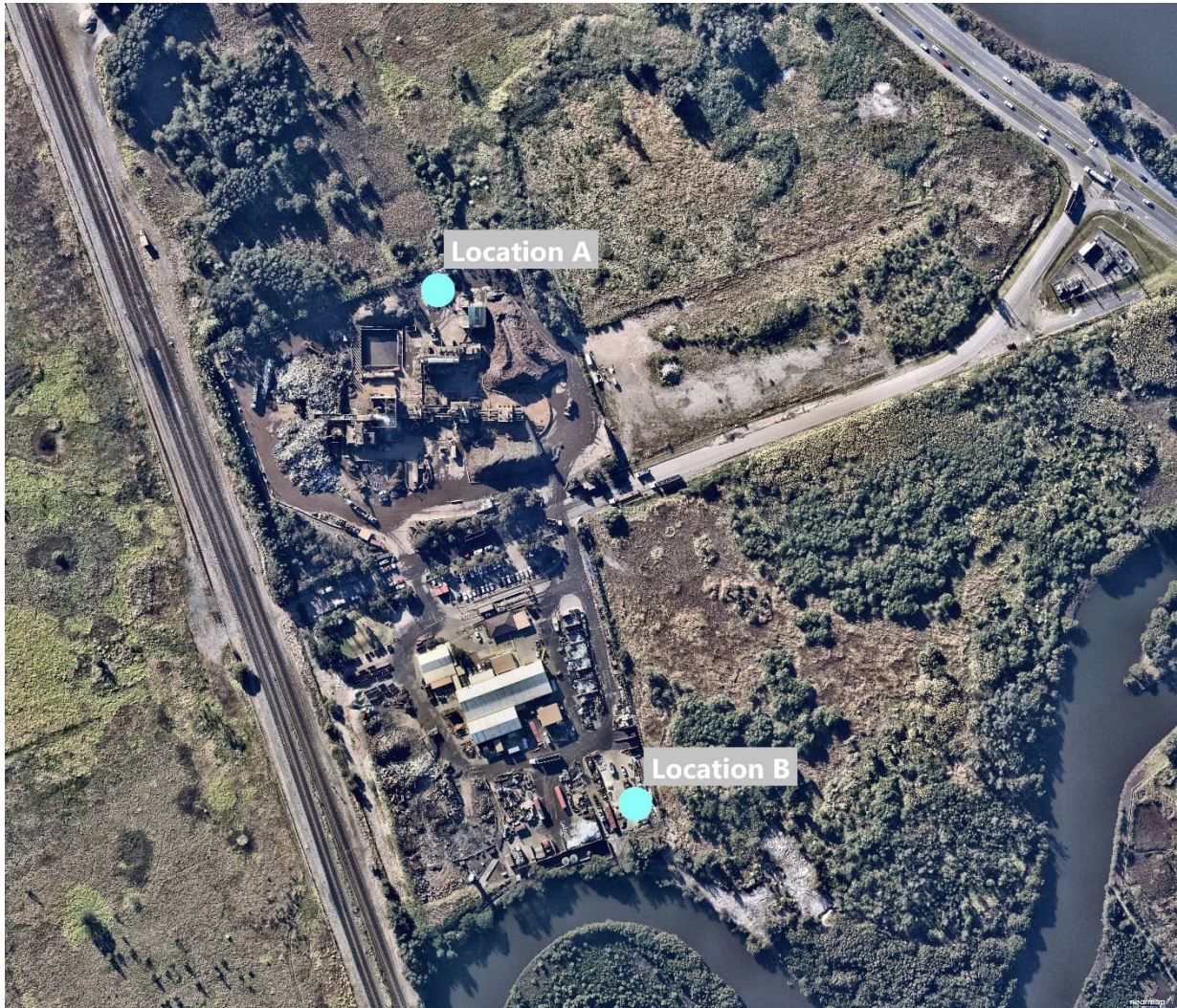
Figure 2 Site Boundary Measurement Locations

Due to external noise sources dominating at the EPL monitoring locations, attended noise measurements were also conducted on the north and south boundaries of the site during day, evening and night periods in order to quantify site noise emissions for the prediction of noise levels at each receiver location in the absence of extraneous noise. Attended noise monitoring was conducted at the north and south boundaries of the site as shown in Figure 2 .