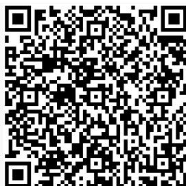
InfraBuild 2022 Sustainability Report